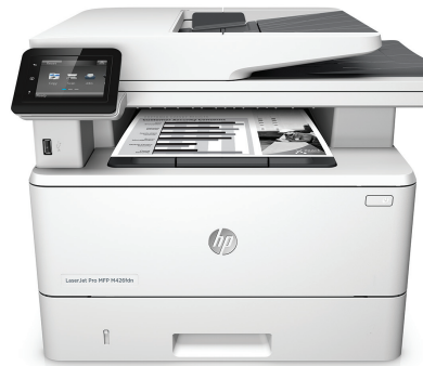
HP LaserJet Pro MFP M426fdn

Fast print, scan, copy, and fax performance, plus robust, comprehensive security built for how you work. This MFP finishes key tasks faster and guards against threats. 1 Original HP Toner cartridges with JetIntelligence give you more pages. 2