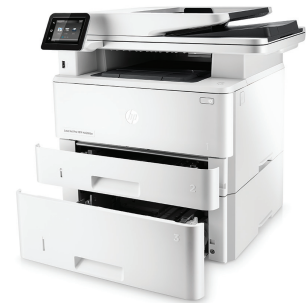
HP LaserJet Pro MFP M426fdw with optional 550-sheet paper tray