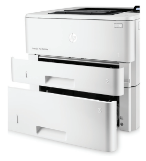
HP LaserJet Pro M402dn with optional 550-sheet tray