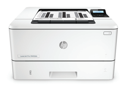
HP LaserJet Pro M402dn

Printing performance and robust security built for how you work. This capable printer finishes jobs faster and delivers comprehensive security to guard against threats. Original HP Toner cartridges with JetIntelligence give you more pages.