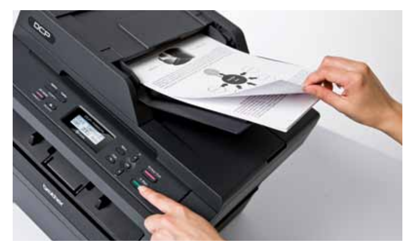
Scan, copy and fax multipage documents easily with the 35 sheet ADF