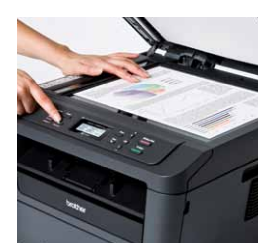
Scan colour documents direct to your PC