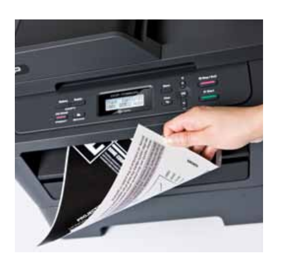
Automatic 2-sided printing to reduce print costs

The DCP-7065DN comes complete with a range of easy-to-use software utilities to improve your productivity. Bundled with the powerful Scansoft® Paperport™ document management software, hard copy documents such as invoices can be scanned in colour, stored and managed electronically for future retrieval.