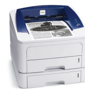
Phaser 3250 shown with optional Tray 2