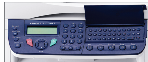
The Phaser 3100MFP/X features a full keyboard

Consumables for the Phaser 3100MFP are part of the Xerox Green World Alliance Supplies Recycling Program. For more information, please visit the Green World Alliance website at www.xerox.com/gwa